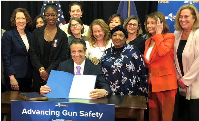
Governor Andrew Cuomo and Advocates at Bill Signing