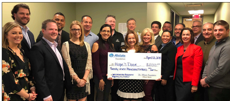
Twenty-seven Allstate agency owners recently joined together to secure a $27,000 Allstate Foundation Helping Hands® grant to benefit Hope's Door.

We are very grateful for the tremendous support we receive from our community in Westchester. Here are several examples: