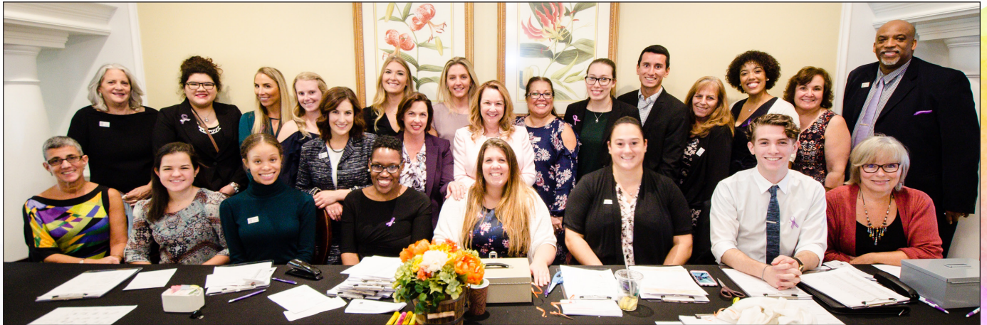
Hope's Door Staff and Volunteers at Annual Luncheon

HOPE'S DOOR Embracing Life Free From Domestic Abuse