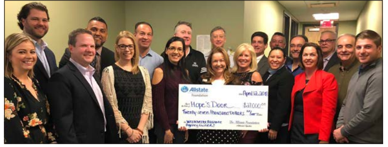
ALLSTATE AGENCY OWNER VOLUNTEERS (NAMES LISTED BELOW)