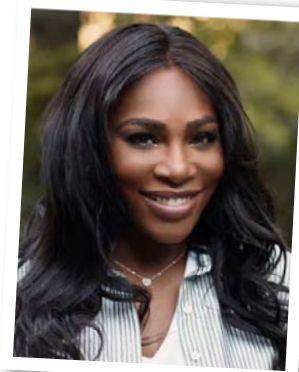
Purple Purse program ambassador, Serena Williams