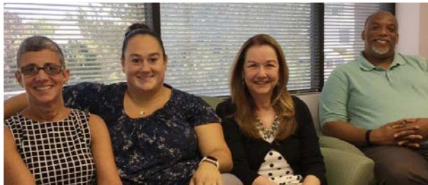
Enjoying our new office at 50 Broadway in Hawthorne, NY