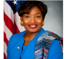
Andrea Stewart-Cousins State Senator, New York

Breakfast will be provided, and free childcare is available. Please note that space is limited, and registration is required to attend.